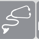
Home Nursing Care