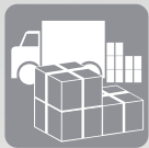
Pick-up and Delivery