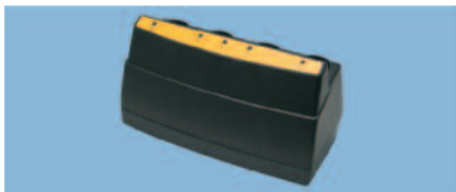
Multi Battery Charger, MC-8000