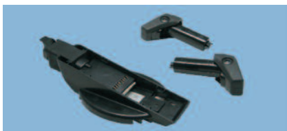
Spare Battery Slot, SBS-8000 Removable Battery Pack, RBP-8000