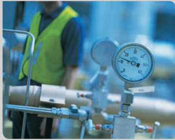
Field Force Automation