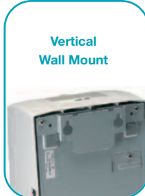
Vertical Wall Mount