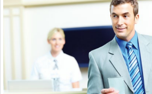
* Future options